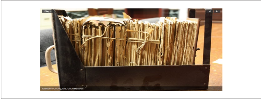
Figure 1. Local court records in Claiborne County, Mississippi.