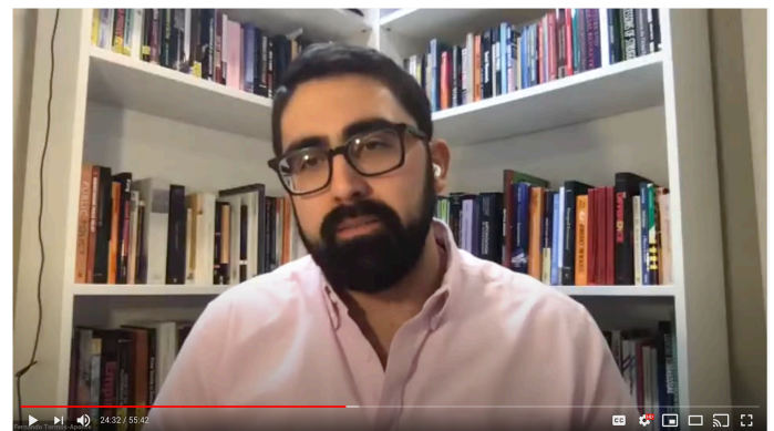
Preparing for Science Advocacy in 2021